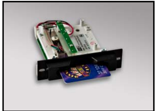
Model PI65-120-RSA with XS1010 bezel